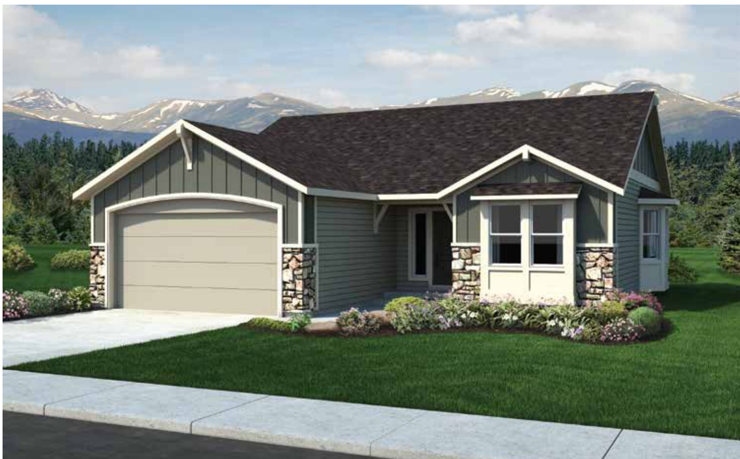
Elevation D | Standard