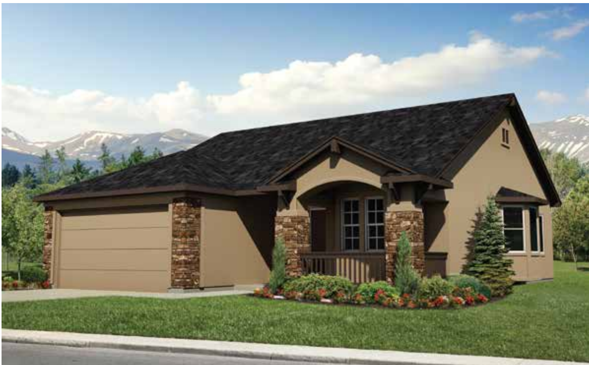
Elevation C | Optional

Artist's conception. All plans, landscaping, features and specifications are subject to change without notification. Measurements are approximate and may vary. Homes are built to blueprint specifications which must be referenced for specific measurements. This is a marketing document and not part of your home purchase contract.