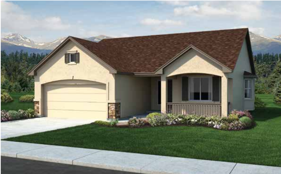
Elevation B | Optional