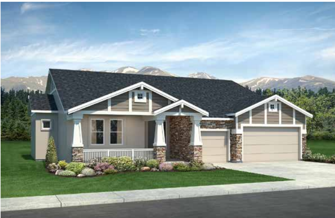
Elevation C | Optional

Artist's conception. All plans, landscaping, features and specifications are subject to change without notification. Measurements are approximate and may vary. Homes are built to blueprint specifications which must be referenced for specific measurements. This is a marketing document and not part of your home purchase contract.