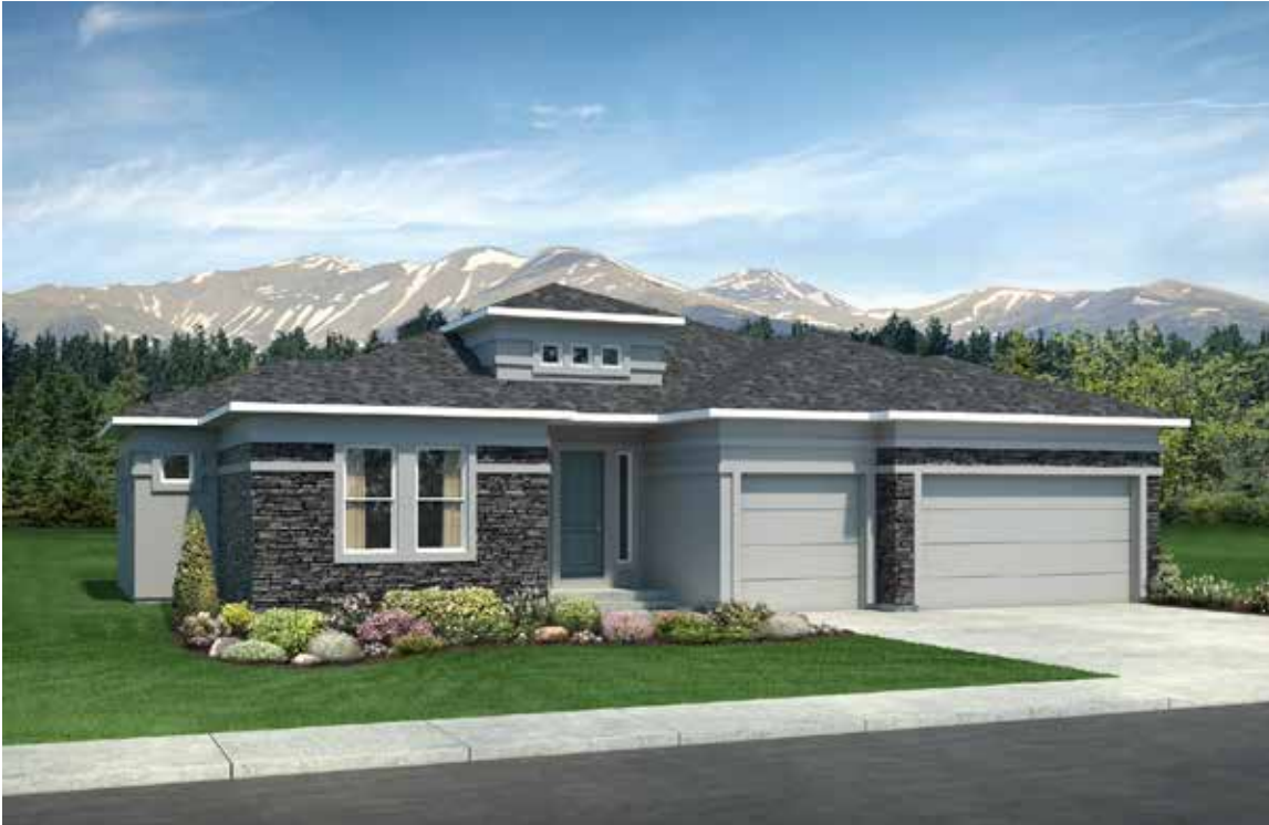
Elevation B | Optional