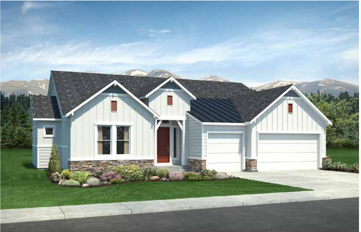
Elevation A | Standard